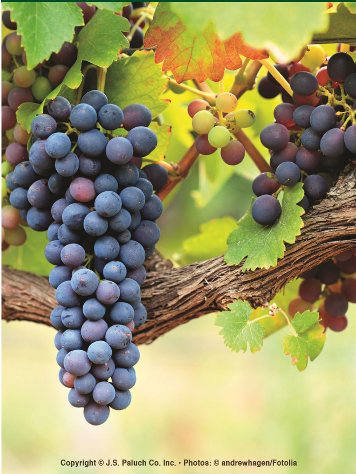
Copyright © J.S. Paluch Co. Inc. • Photos: © andrewhagen/Fotolia

199 Brandon Road, Pleasant Hill, CA 925-682-2486